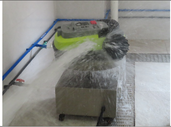
During Test-Sample B